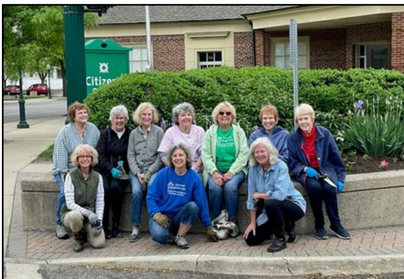
Plymouth Garden Club members after planting OUR SPACE in downtown Plymouth