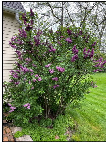
100 year-old double French lilac, a family heirloom – Dorothy Simescu