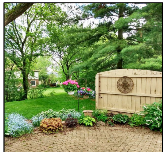
View from her kitchen window – Shirley Connors