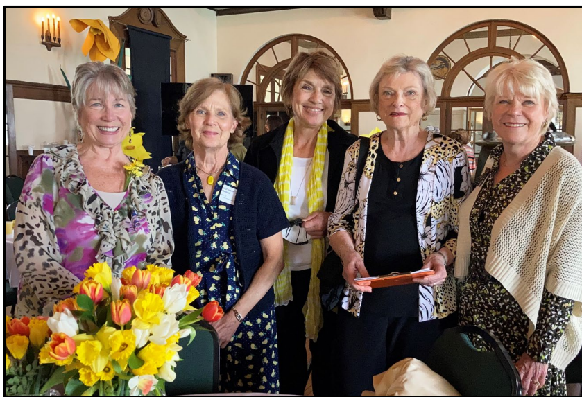
Many Troy Garden Club members attended Daffodil Day 2022 on Belle Isle.