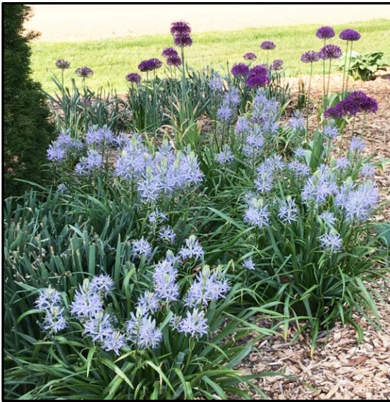
Blue star & allium – Jan Lopata