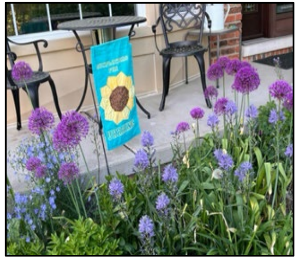
Plymouth Garden Club photos continue on page 13 . . . . .